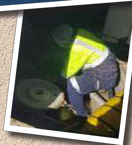
Top: M.V. Ouro Do Brasil discharging Orange Juice Concentrate at Newcastle's West Basin.